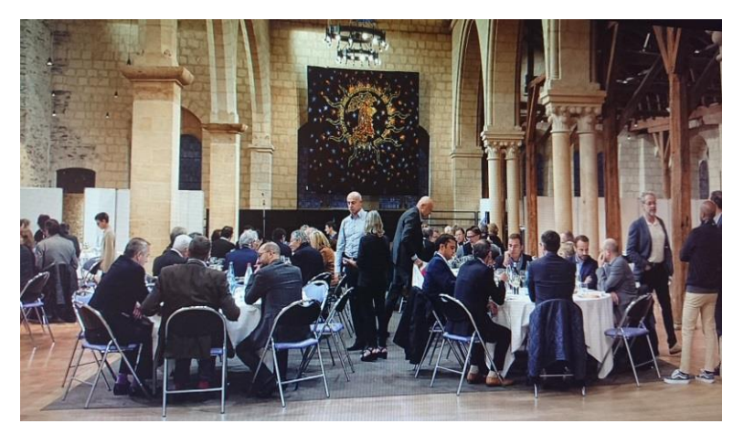
GF 2019, Gala Dinner at the Greniers Saint Jean