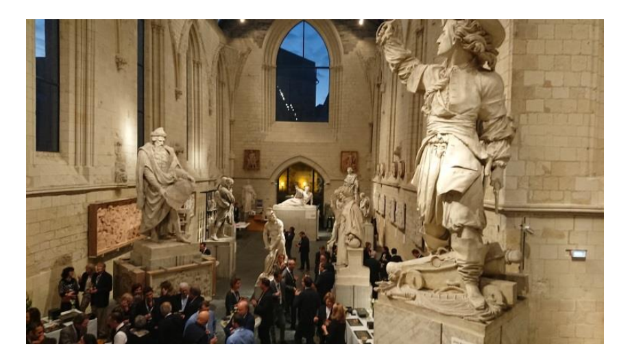
GF 2019, Welcome Event at the Galerie David d'Angers