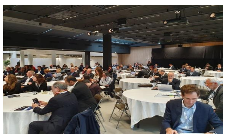
GF 2019, Centre des Congres Jean Monnier