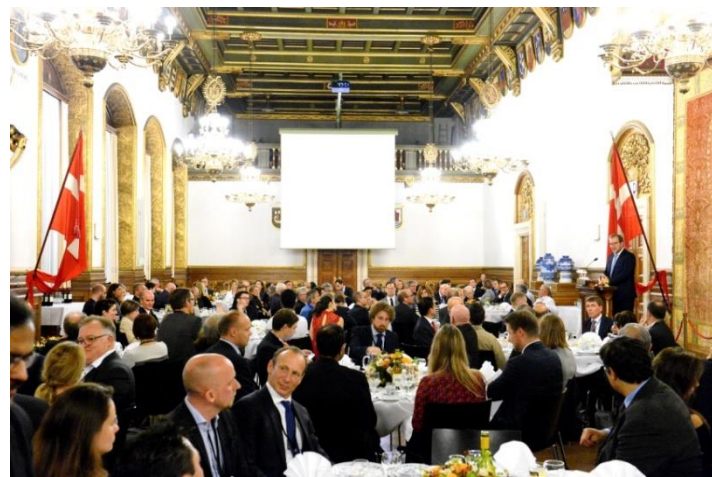
Gala Dinner 2018 - Annonce Angers