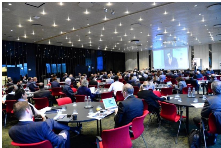
Intervention Rasmus Jarlov , Minister of Industry, Business and Financial Affairs, Denmark