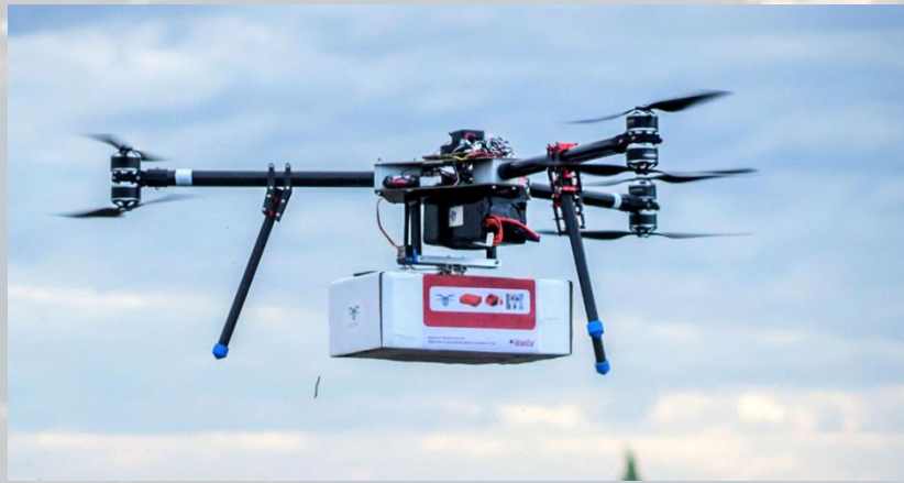
Aid delivery in Malawi with drones