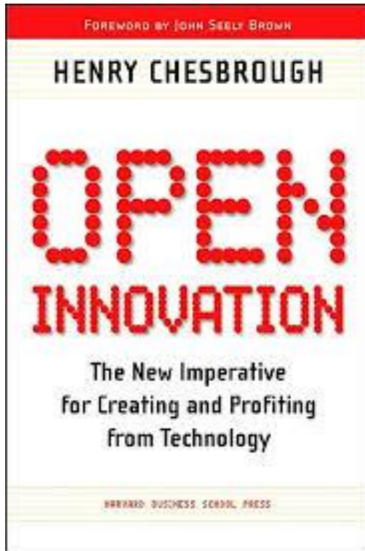
External Technology Insourcing