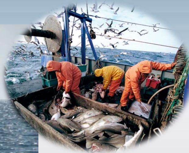
Wild catch and fish farming