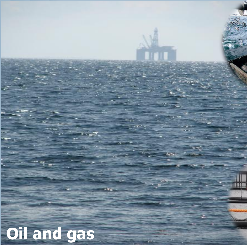
Oil and gas