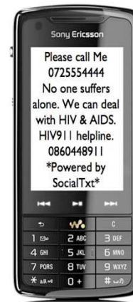
Education & Awareness