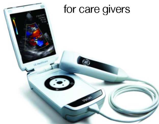
Mobile devices for care givers