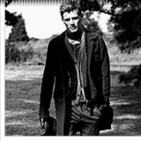
Looking Good: The Sequel