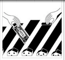
Op-Ed: Mortgage Justice Is Blind