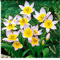
Persuading Bulbs to Bloom