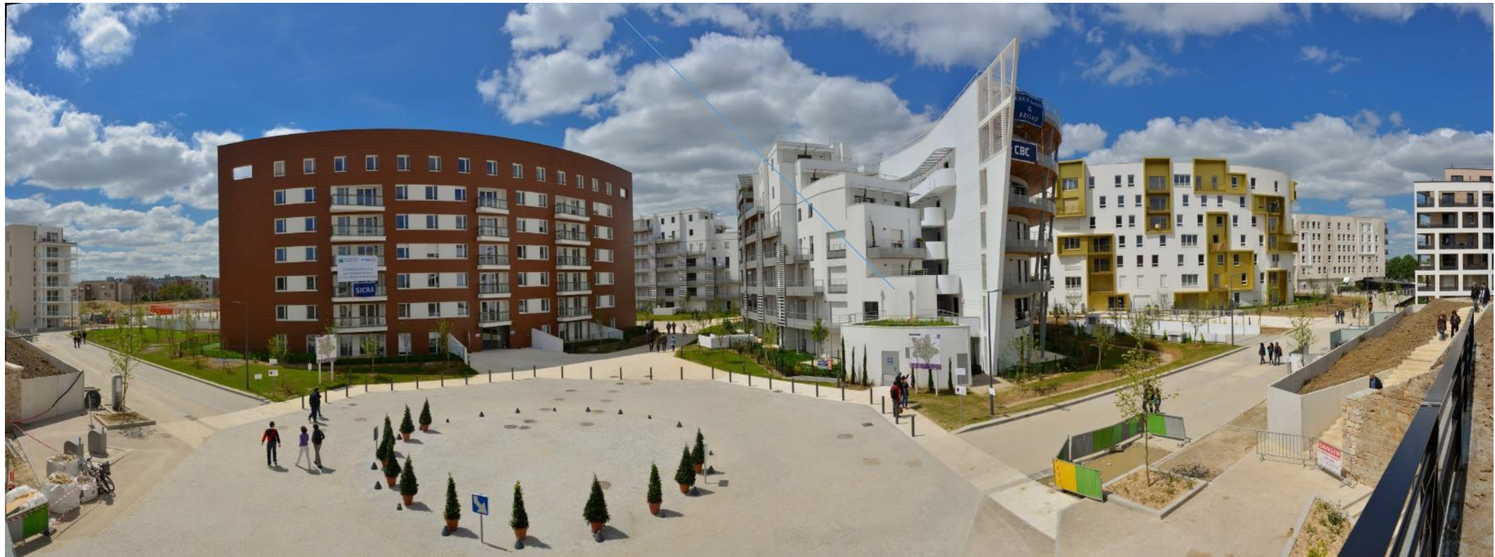
The Digital Fort, a digital eco-district in Issy