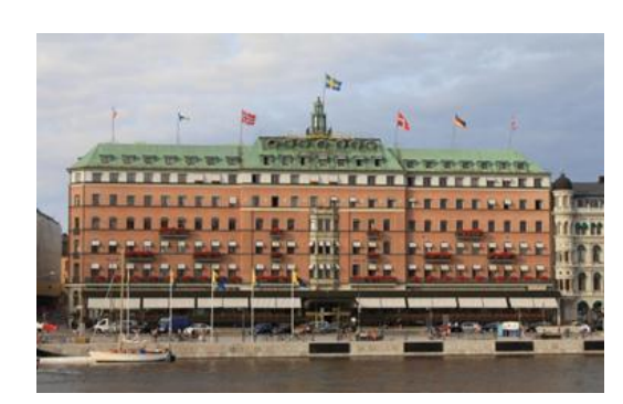
GRAND HOTEL STOCKHOLM VENUE