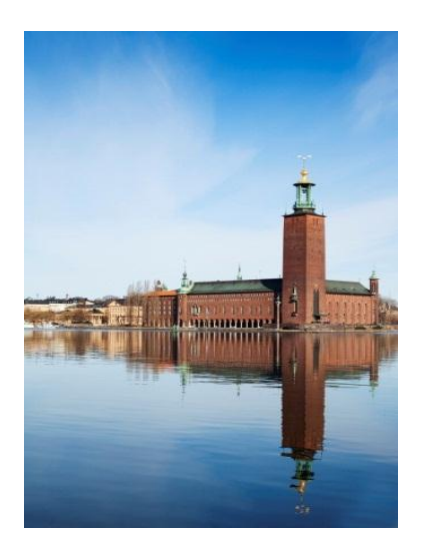
STOCKHOLM CITY HALL